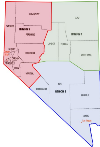
NEVADA REGION MAP

INCIDENT DESCRIPTION: The Nevada Operations Center (NVOC) is partially activated per the Division of Emergency Management (DEM) Spring Thaw Plan. The purpose of this activation is to increase our efforts for monitoring, preparedness, and supporting any jurisdictions in responding to flooding impacts.